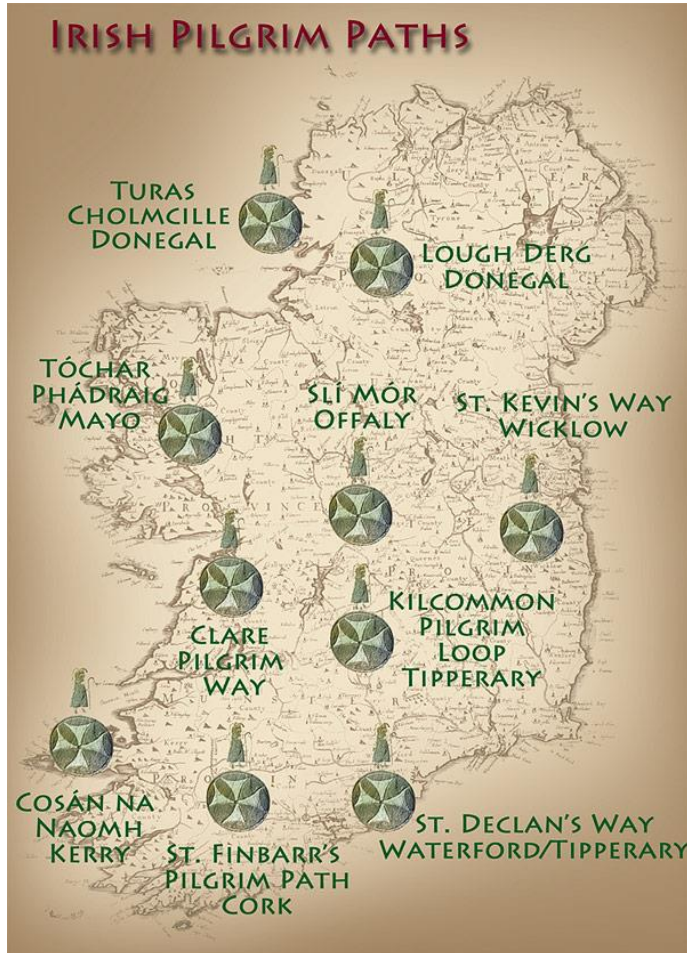
Pilgrim Path map from the Heritage Council: www.pilgrimpath.ie/pilgrim-paths-day/