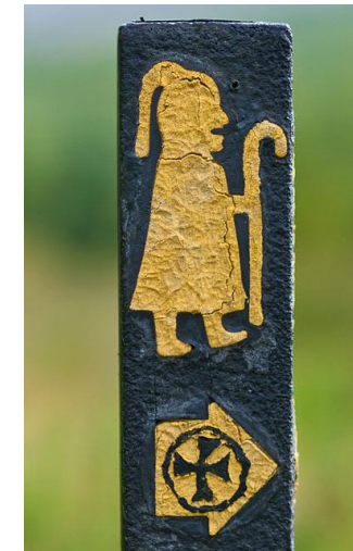
Pilgrim Path Waymarker (Ireland)

Roles: Activity Leaders Route Coordinators Reflection Coordinators First Aiders