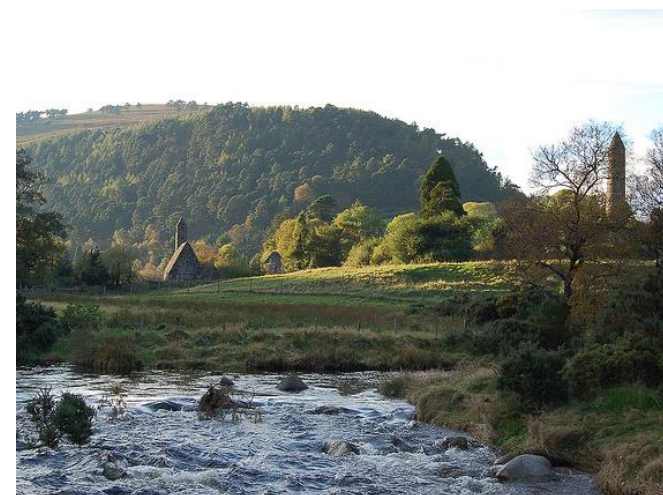
Glendalough Stream

The right atmosphere is important for the prayers, reflections and stories, otherwise they won't work. Explain to everyone what is going on and make sure the group is calm